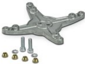
VESA 75/100 connection plate with M5 mounting kit for DCS 15" display support, die cast aluminum, 80 g

Please be informed that the data shown in this PDF Document is generated from our Online Catalog. Please find the complete data in the user's documentation. Our General Terms of Use for Downloads are valid ( http://phoenixcontact.com/download )